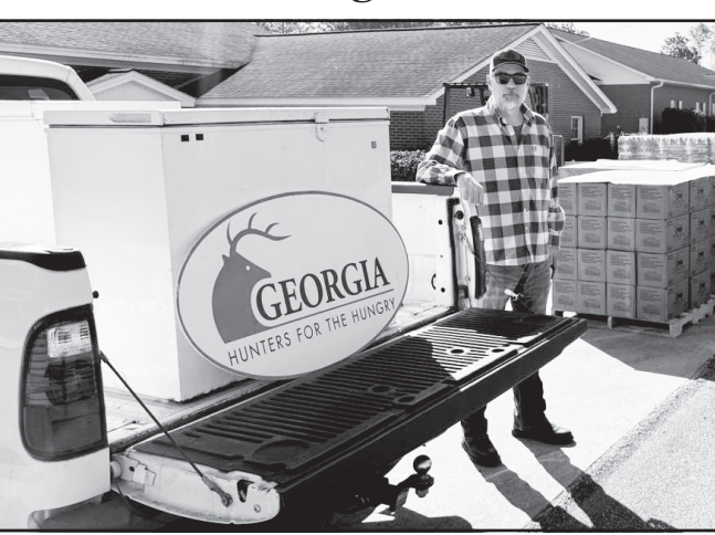
Donated Deer